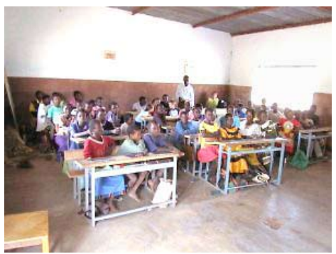
Classrooms of the International School of Ouagadougou (ISO), left, and the Yimdi village school, right.