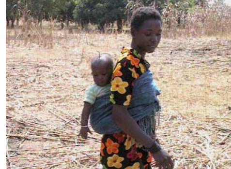
Burkinabe mother and child.

WebQuest template by Bernie Dodge, The WebQuest Page (http://edweb.sdsu.edu/webquest/overview.htm).